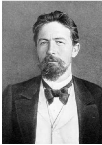
Fig 4.1 Anton Chekhov