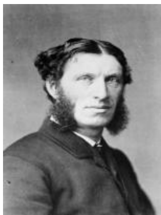
Fig 2.4 Mathew Arnold

Arnold is as great an exponent of Victorian elegiac as Tennyson. According to him, the main duty of a writer is to present his criticism of life in whatever medium he can as richly, luminously and broadly as possible. In his poem Dover Beach , he reflects the problems afflicting the Victorian society. Loss of faith is given its most memorable utterance; public values have disappeared and all that is left are the private affections, little society of love and friendship. His two best known poems are The Scholar Gipsy (1853), which is about the poet himself and his generations, and Thyrsis (1866), which is an elegy to Arthur Hugh Clough who died in 1861.