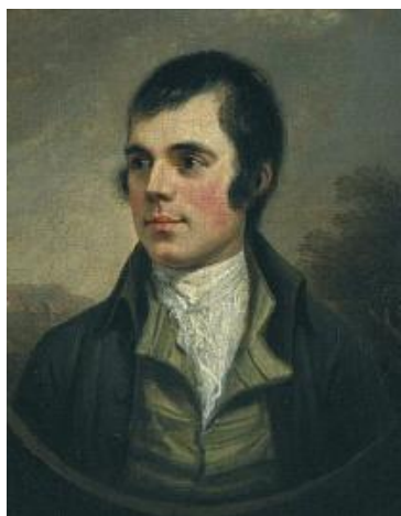
Fig 1.1 Robert Burns