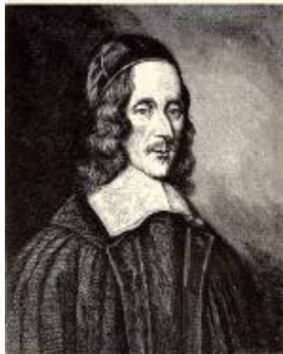
Fig 1.2 George Herbert

George Herbert's poems will always be remembered for the deep religious devotion they reflect, for their linguistic accuracy and fluidity in rhyme. The great Romantic poet, Samuel Taylor Coleridge had written: 'Nothing can be more pure, manly, or unaffected,' in the context of Herbert's use of language in his poetry.