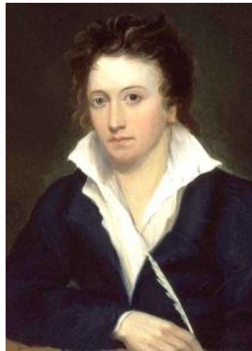
Fig 1.4 Percy Bysshe Shelley