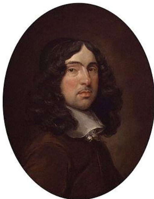
Fig 1.3 Andrew Marvell