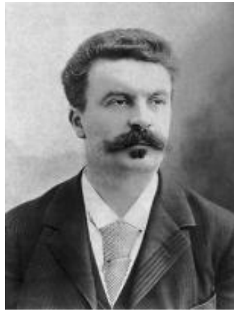
Fig. 3.1 Guy de Maupassant

place in the Loisel's mean dwelling and only some part of it is set in the palace where the ball takes place, although there is no description of the palace. We can assume the grandeur of the place by the measures of Mathilde's ecstasy during the ball. Later, with the twist of fate, Mathilde has to leave the house that she does not love much due to its impoverished look. She moves to a much smaller house than she could have ever wished for.