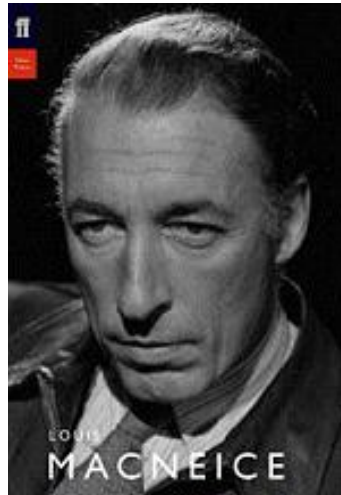
Fig 3.3 Louis MacNeice