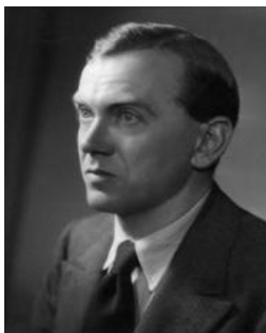
Fig 5.1 Graham Greene

Greene always kept his distance from literary politics, neither belonging to any group or movement, and neither seeking nor receiving the endorsement of temporarily fashionable schools of criticism. However, every writer necessarily draws on literary tradition, however selectively, and Greene is no exception. In childhood and youth, his imagination was deeply affected by reading historical romances like Marjorie Bowen's The Viper of Milan and the adventure stories of writers such as Robert Louis Stevenson, Rider Haggard and John Buchan. Later, he came under the spell of Joseph Conrad's more profound and pessimistic tales of the outposts of the empire.